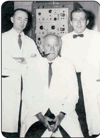
The Inventors of Modern CPR